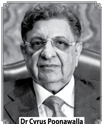
Dr Cyrus Poonawalla